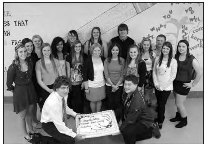
2013 NHS New Members